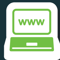
Your web site