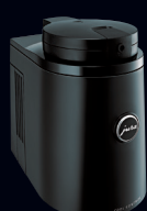
with JURA COOL CONTROL 1 Ltr Milk Cooler