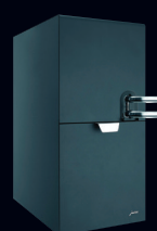
with JURA Compressor Cooler Pro